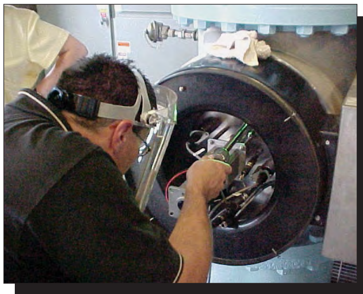
UV Sensor Check Being Performed on a Medium Pressure UV Reactor

These options are not intended for long-term use and should not be used for longer than six months.