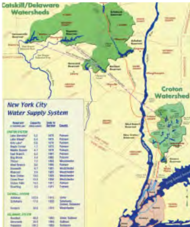
Figure 2. New York City Water Supply System.

As a result of the ongoing success of the watershed protection program and continued excellent water quality of the Catskill and Delaware systems, EPA has granted New York City relief from the remaining filtration planning/design requirements of the FAD, including the completion of the filtration facility's final design. In place of this deliverable, the City committed to initiating an in-depth look at UV disinfection as a possible alternative to filtration for the Catskill and Delaware water systems.