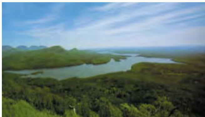
Figure 1. Ashokan Reservoir of the Catskill System

Foresight by our predecessors, as far back as the mid-1800s, has provided a system with exceptional source water quality, and is almost entirely supplied by gravity. The New York City water supply includes three upstate reservoir systems: the Croton, Catskill (Figure 1), and Delaware. Together these supplies include 19 reservoirs and three controlled lakes, with a total available storage capacity of approximately 580 billion gallons (2,195 million liters).