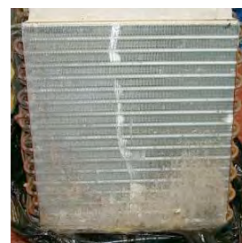
Figure 2. Coil fouling blocks airflow.

Microbial taxa identified by culturing methods in both office buildings and homes include Aspergillus versicolor , Cladosporium cladosporioides , Alternaria alternata , Penicillium spp. and